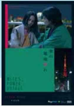
『Wife's Power Outage』 Numerous national and international awards and nominations!