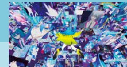
Google/Ado | 夜のピエロ360° Music Video Digital experience, Branded content