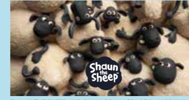
SHAUN THE SHEEP AND SHAUN'S IMAGE ARE ™ AARDMAN ANIMATIONS LTD. 2024