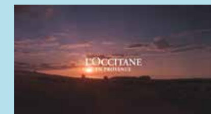
L'OCCITANE JAPON K. K 「永久花イモータル「美しくなる力」篇 (TV commercial) Integrated marketing communications