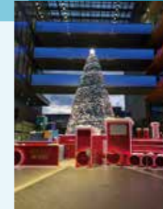
「CHRISTMAS JOURNEY@二子玉川ライズ」 Planning/Direction