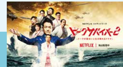
「Last One Standing」 Season 1 and 2 – Now available for streaming exclusively via Netflix worldwide Season 3 – Scheduled for worldwide distribution exclusively via Netflix in 2024