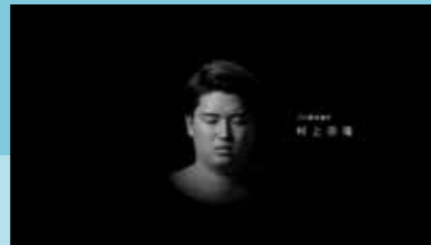
Yakult 1000 「村上宗隆」篇