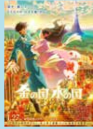
『Gold Kingdom and Water Kingdom』 © Nao Iwamoto / Shogakukan © 2023 "Gold Kingdom and Water Kingdom" Film Partners