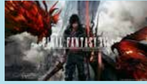
『FINAL FANTASY XVI』 © 2023 SQUARE ENIX CO., LTD. All Rights Reserved. FINAL FANTASY, SQUARE ENIX and their respective logos are trademarks or registered trademarks of Square Enix Holdings Co., Ltd.