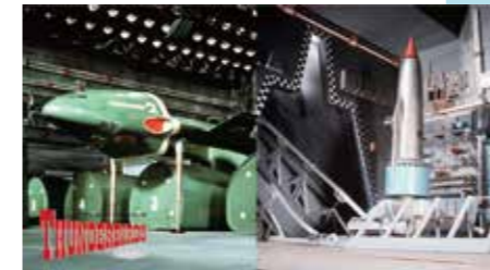
Thunderbirds ™ and © ITC Entertainment Group Limited 1964, 1999 and 2024. Licensed by ITV Studios Limited. All rights reserved.