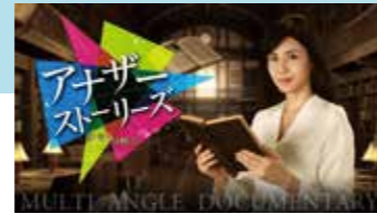
『アナザー・ストーリーズ 運命の分岐点』