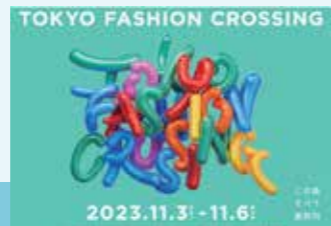
「TOKYO FASHION CROSSING」 Event direction and operation