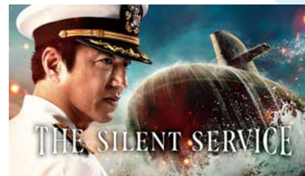
Kaiji Kawaguchi /KODANSHA