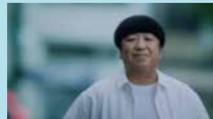
住友生命保険 「それはおなじ。」篇