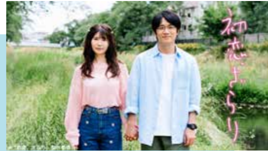
『初恋、ざらり』 © 「初恋、ざらり」製作委員会