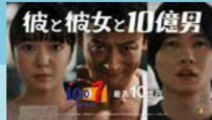
LOTO7 episode5 「積み重ねる男」篇