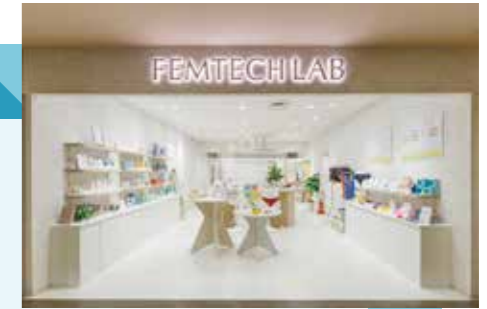
ティーガイア「FEMTECH LAB」 Planning/Direction/Store Design