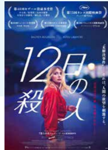
『The Night of the 12th』 © 2022 - Haut et Court - Versus Production - Auvergne-Rhône-Alpes Cinéma Photo credit: Fanny de Gouville