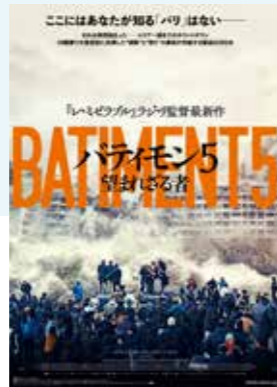
『Block 5』