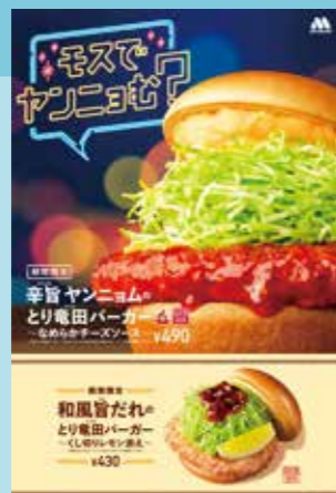
モスフードサービス 「モスでヤンニョむ?」篇 (TV commercial) Integrated marketing communications