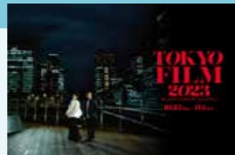
「The 36th Tokyo International Film Festival」 Management of the opening events