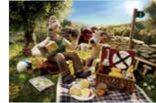
© and ™ Aardman/W&G Ltd. All rights reserved.