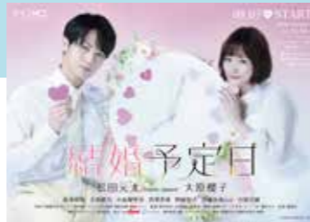
『結婚予定日』