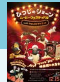
「ひつじのショーラン」ムービー・フェスティバル with ウォレスとグルミット