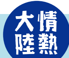
JOUNETSU-TAIRIKU The Documentary