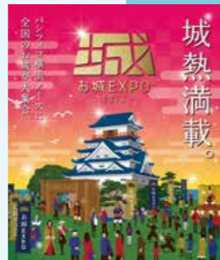
お城EXPO 2023