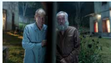
『My Neighbor Adolf』