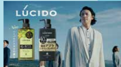
マンダム ルシード 「頭のニオイケア」篇