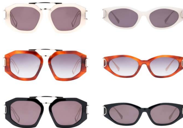
2024년, 'H2C' 안경 협업제품 판매