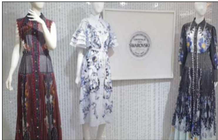
2020년, 스와로브스키 125주년 전시회 DOUCAN