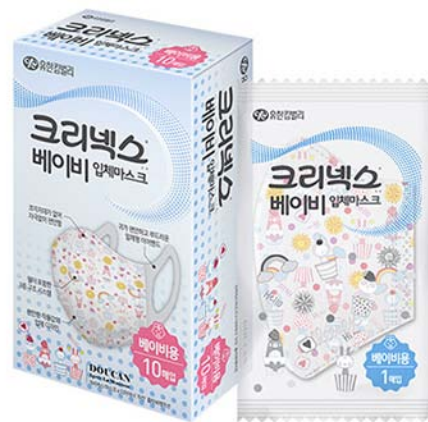
2020년, '유한킴벌리' + 두칸 마스크 출시 DOUCAN