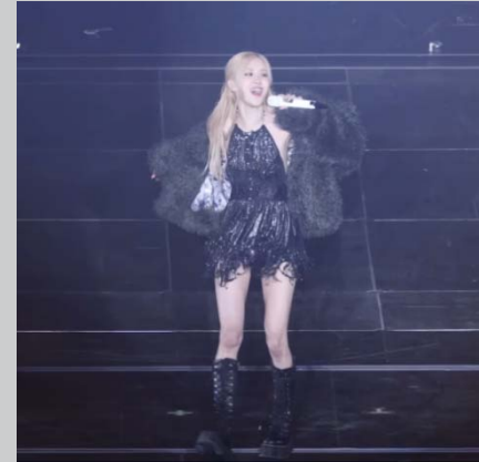
Blackpink - ROSE(로제) : BLACKPINK WORLD TOUR [BORN PINK], DOUCAN FUR 착용