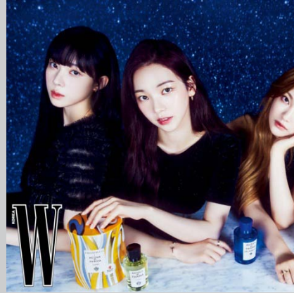
Easpa - WINTER(윈터) : 잡지 'W' 화보, DOUCAN DRESS 착용