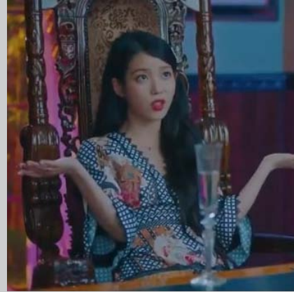
IU(아이유) : 드라마 '호텔 델루나', DOUCAN DRESS 착용