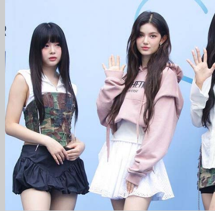
NewJeans - 하니, 다니엘 : 서울패션위크 24SS 포토월