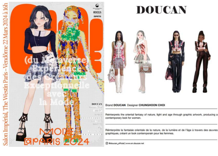
2024년, '제페토' + 두칸 아이템 출시