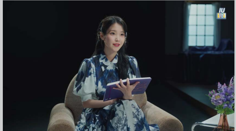
IU(아이유) : IU YouTube - DOUCAN Shirt+Skirt 착용