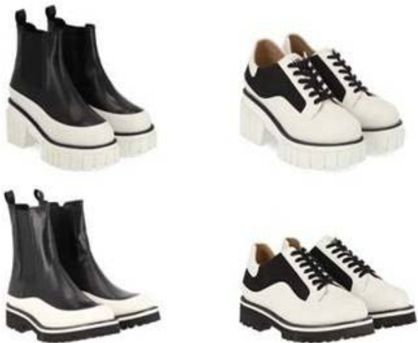
2022년, '엘칸토' + 두칸 콜라보레이션