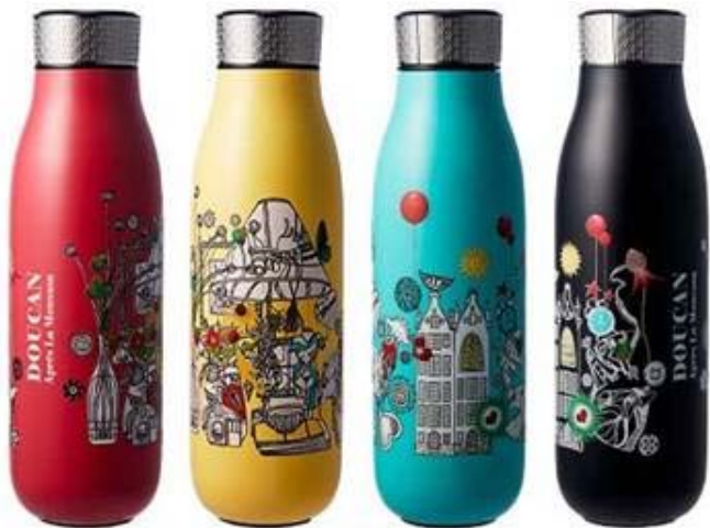
2020년, '무비스트' + 두칸 아트웍 텀블러