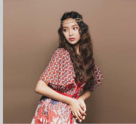
NewJeans - 헤인 : 화보, DOUCAN DRESS 착용