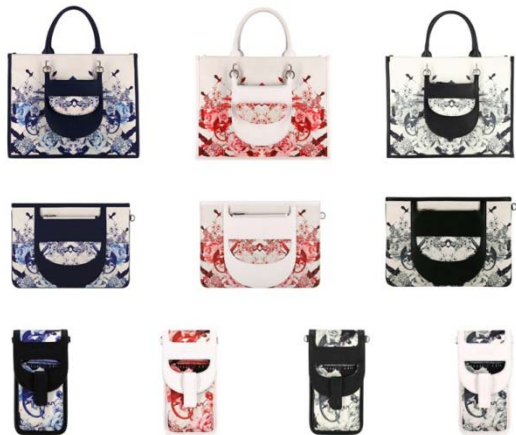
2024년, '엘리스마사' 가방 협업제품 판매